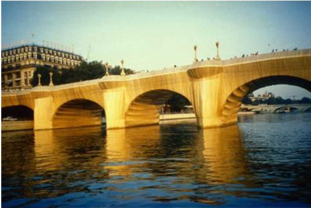
Figure 1: The Pont Neuf Wrapped, Paris 1975-1985