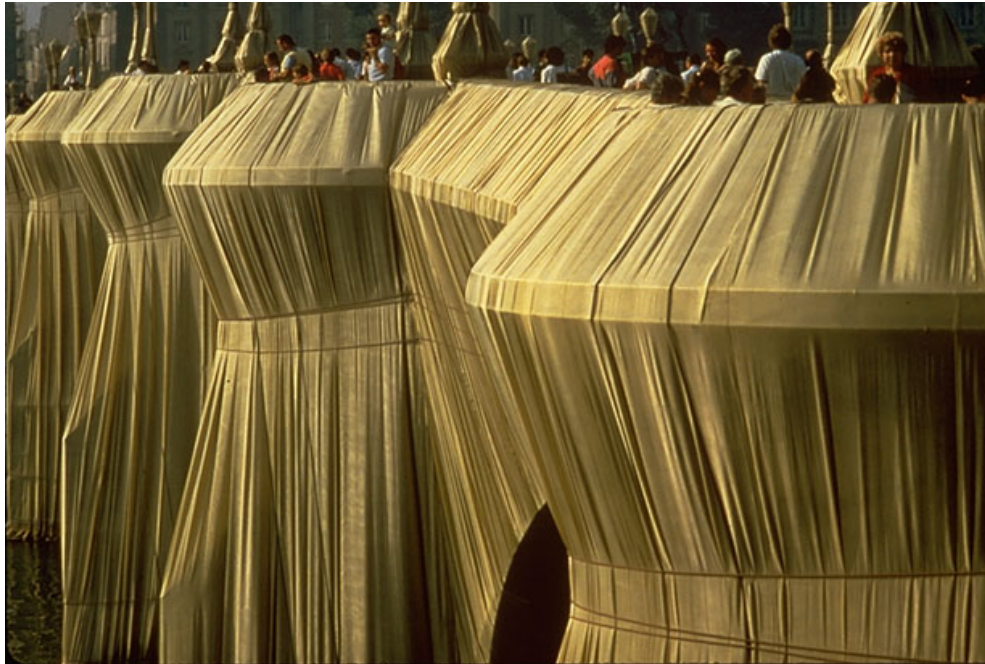
Figure 3: The Pont Neuf Wrapped , Paris 1975-1985